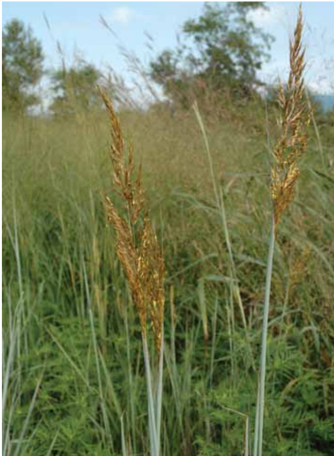
Fig. 7. Indiangrass is easily recognizable by the blueish hue of its stems and the large yellow seedheads. Indiangrass is the latest of the NWSG to produce seedheads; typically they appear in July and August.

Probably the most widely used variety in the Mid-South, Rumsey was developed from plant material from south-central Illinois. It produced yields similar to Cheyenne in variety trials conducted by the University of Kentucky.