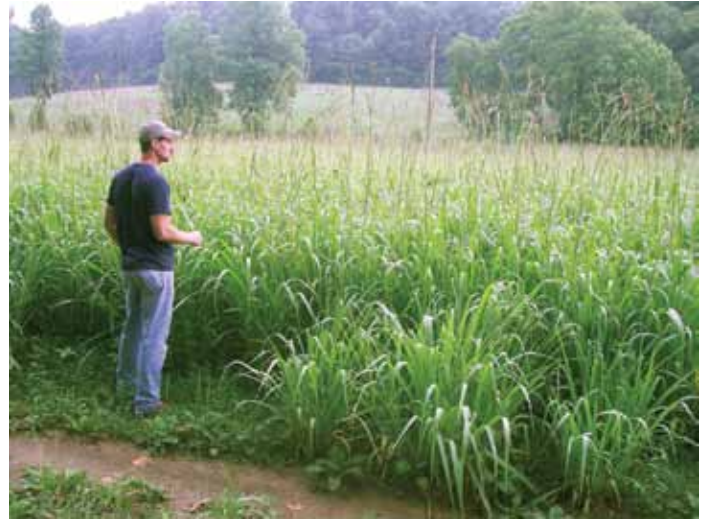
Fig. 8. Eastern gamagrass produces impressive yields of quality forage. Its seedheads appear in June and are quite distinctive.

Like switchgrass, eastern gamagrass produces very high yields and tolerates wet sites (Fig 8). It begins spring growth sooner than the other NWSG and also maintains growth later in the season than the other species – with the exception of indiangrass. It can support high stocking rates due to its high productivity.