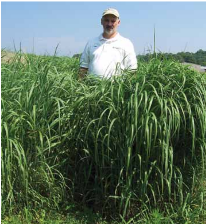
Fig. 2. This 18-year-old stand of cave-in-rock switchgrass continues to produce large volumes of quality forage.

As with any forage, hay quality is strongly influenced by timing of harvest. Harvest of NWSG at late-boot stage will typically produce hay with protein levels of 10 percent or higher. However, like most warm-season forages, NWSG will test at levels below those for cool-season forages harvested at a comparable maturity level. This is partly because proteins in NWSG do not break down as quickly during ruminant digestion and bypass the rumen; thus, they are referred to as “bypass proteins.” Because bypass proteins can be absorbed in the intestines, animal performance on NWSG exceeds what we would predict based on forage sample analysis. For example, when grazed, NWSG routinely produce from 1.5 – 2.5 lb of daily gain in steers (Fig 3). Furthermore, NWSG forage quality is not diminished by endophyte fungi, a substantial problem with tall fescue.