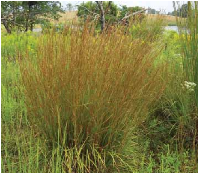
Fig. 6. A mature clump of little bluestem, a smaller bunch grass that often shows a reddish hue on its stems. Note the mature big bluestem plant in the background on the right. Despite its smaller size, little bluestem can produce desirable forages – even on poor ground.

A more recent release, OZ-70 was developed from plant material collected from a number of locations in the Mid-South. As such, it is one of the first varieties of big bluestem from this region. Like other varieties of big bluestem, it has wide site adaptation, but will not tolerate flooding as well as switchgrass.