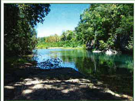
Indian Creek flows through property for 4 miles

The property has been under Quality Deer Management (QDM) guidelines for the past fifteen years with a goal to create a haven for both the hunter and the hunted. Timber management and stand improvement are ongoing and never ending tasks. The property consists of 3,070 acres. There are 865 acres of mature upland hardwood and hardwood plantation. The Coley property also has 2,000 acres of pine plantation, Stream Management Zones (SMZs), and wildlife openings. Indian Creek flows through the property for approximately four miles providing recreational opportunities for fishing, canoeing, and wildlife observation. Timber management practices include thinning, prescribed burning, mid-rotation release to control undesirable species, fertilization, road maintenance, and fire break construction. Approximately 80 acres of openings and wildlife food plots are intensively managed to provide both winter and summer food sources. Supplemental food is provided throughout the year with wildlife feeders strategically placed throughout the property.