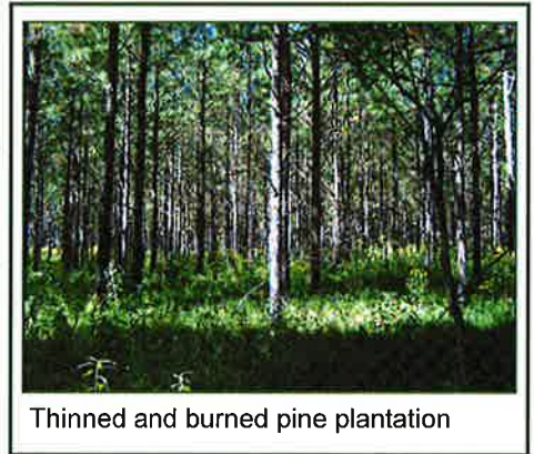
Thinned and burned pine plantation