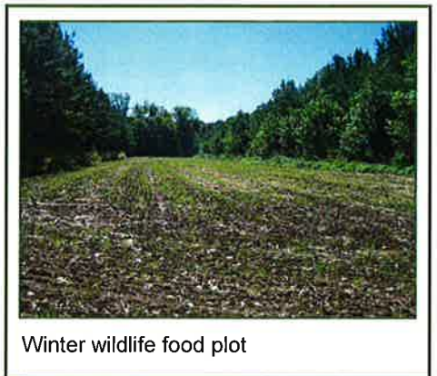
Winter wildlife food plot